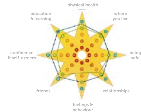
Example of a mapped My Star