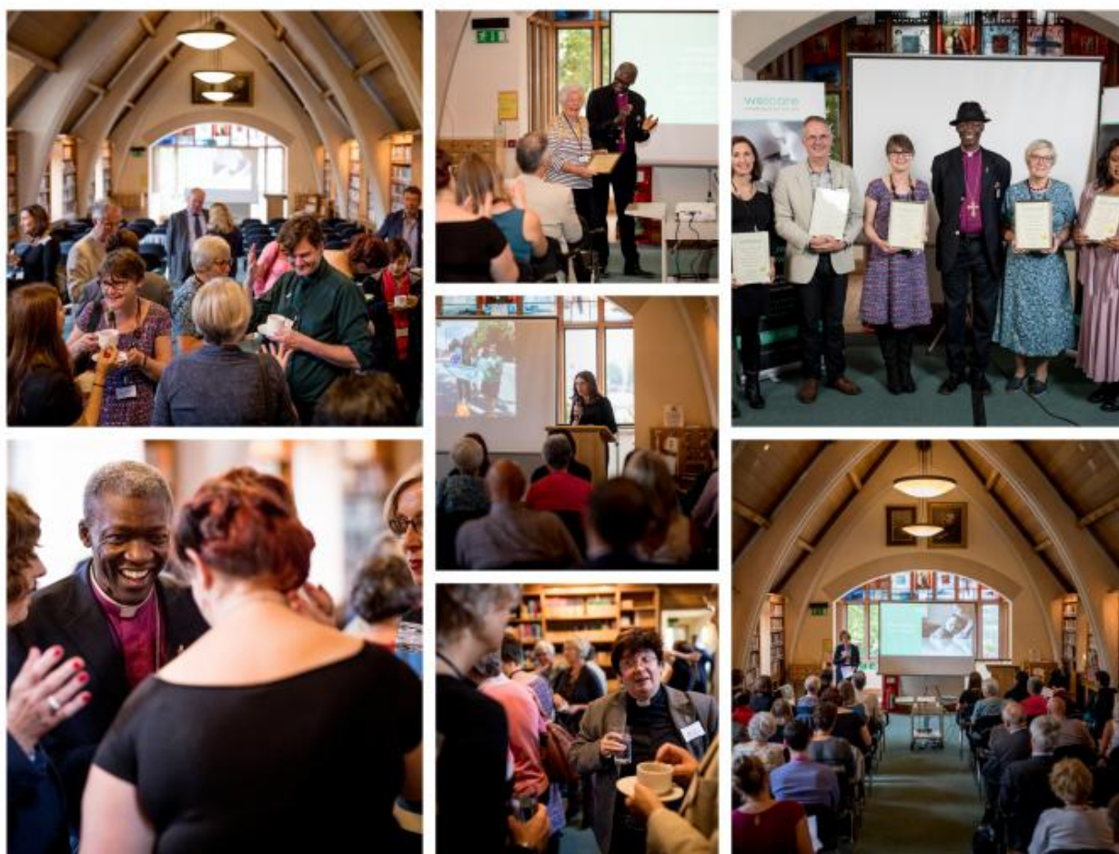
A few photos from our Annual Meeting & Supporter & Volunteer Awards 2017

Thank you so much to every single one of our volunteers, community fundraisers and supporters. We are so grateful for all that you do to support Welcare's service users, staff and each other. We could not do what we do without you. You are all an inspiration to us all!